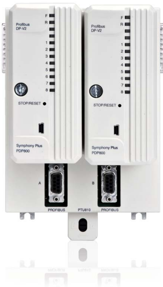
1 SD Series PDP800: Redundant configuration

No other automation platform has such a long field record and large installed base in power and water applications as Symphony. For more than 30 years, ABB has evolved the Symphony family, ensuring that each new generation enhances its predecessors and is backwardly compatible with them - all in accordance with ABB's long-held policy of 'Evolution without obsolescence.'